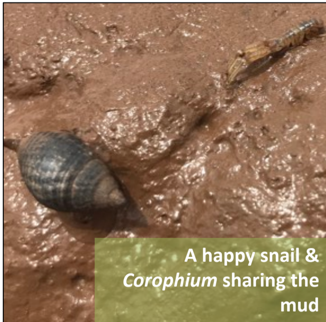
A happy snail & Corophium sharing the mud