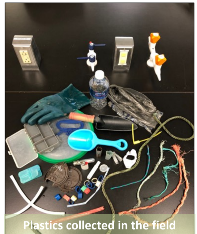
Plastics collected in the field

Mature male and female snails were collected from Avonport Beach, Nova Scotia, brought back to the K.C. Irving Centre Environmental Science Centre, and placed into six aquaria. Each aquarium represents an experimental group (field, control, low plastic, high plastic, extreme plastic, biodegradable plastic). Microplastics were created by collecting plastics from a local beach and grinding them into small fragments. Following four weeks of exposure to the snails to microplastics in their diet (biofilm), tissues will be analyzed with histology and scanning electron microscopy (SEM) to visualize how tissue structure changes in response to microplastics in the snails diet.