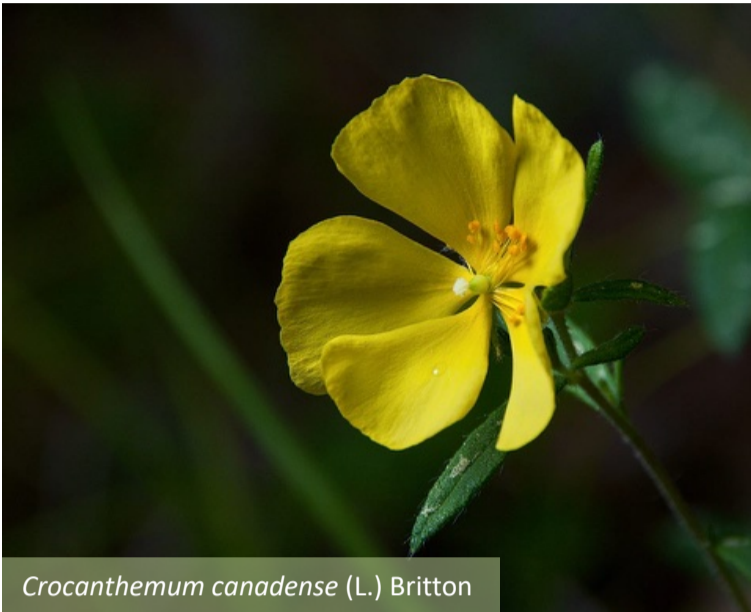
Crocantthemum canadense (L.) Britton