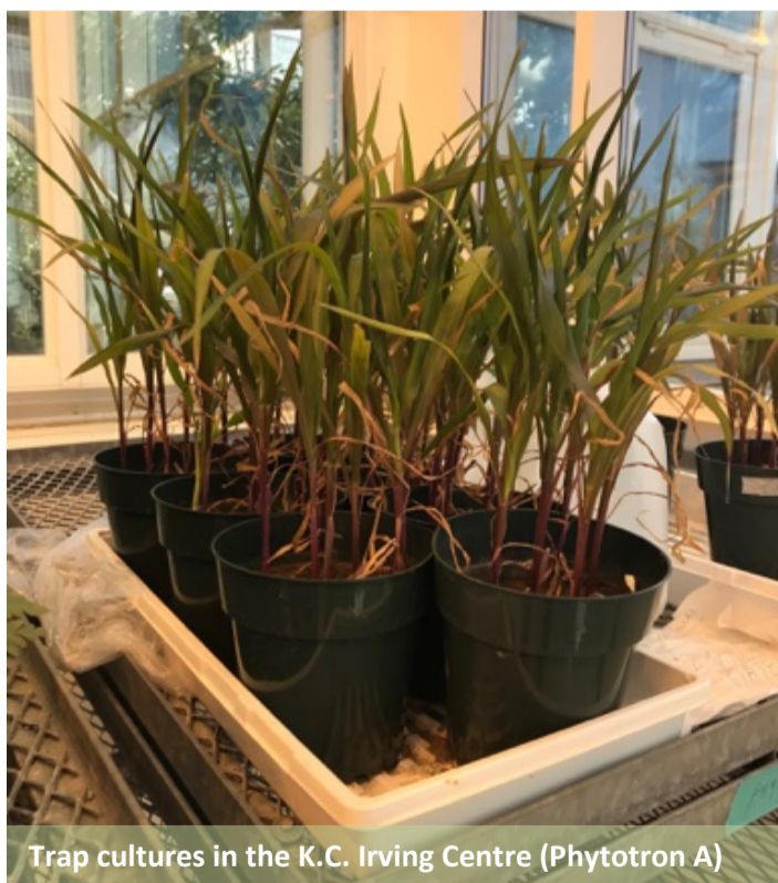
Trap cultures in the K.C. Irving Centre (Phytotron A)